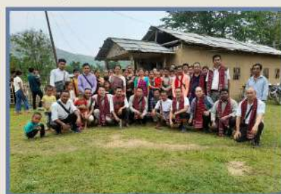
Patlungkon B/C nu kepelemiako ze mirhi chükellie