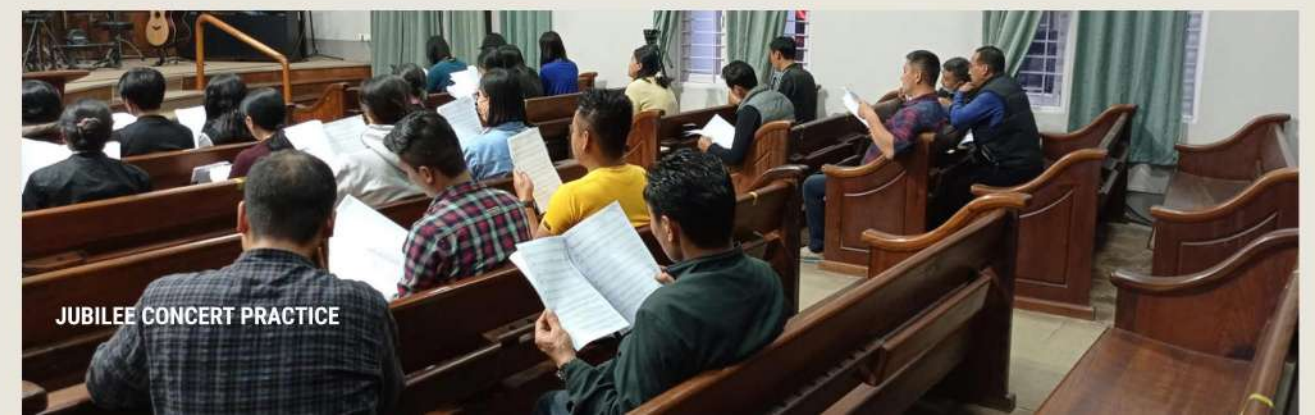
JUBILEE CONCERT PRACTICE