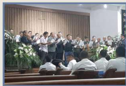
KBCCTK Combine Service nu UBCTK-e tsali chüketha