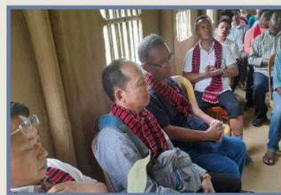
Agape B/C Karbi Assam nu kepelemiako ze kehau keba