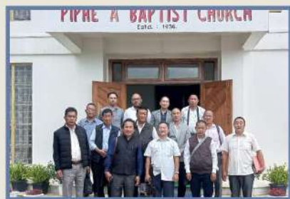
Piphe 'A' B/C nu tsu zhapu chükellie.