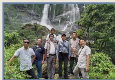
Patlungkon, Karbi Assam