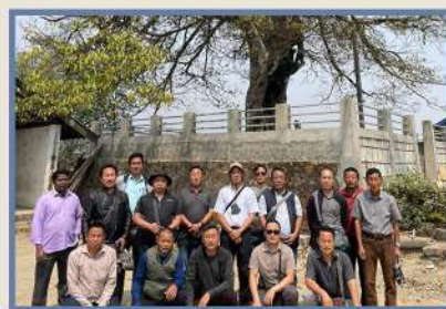
UBCTK-e makhel (mekhrora) rüna nu vokellie