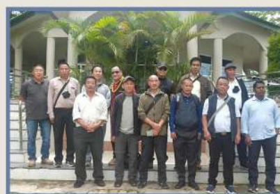
Loktak Lake team