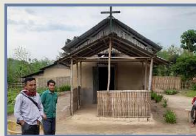
Kannan B/C Karbi UBCTK-e kehaukiu chüshü