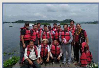
Loktak Lake (Imphal) nu vokellie